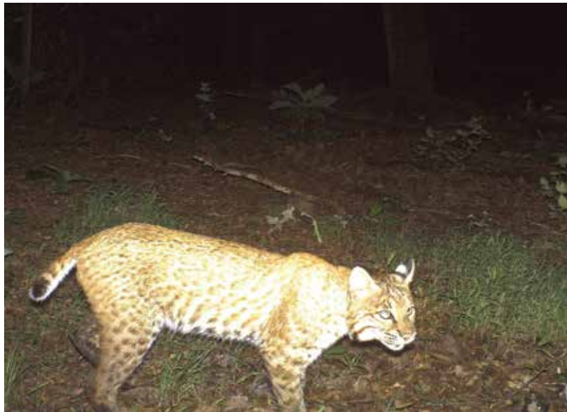
The elusive bobcat travels under the cover of night.