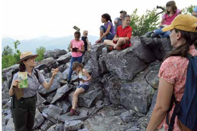
A ranger led children on a guided hike during the grand opening of the Black Rock Summit Trail at Shenandoah National Park in Virginia.

As the network of trails has grown, so has the number of Trail TRACKers, who register