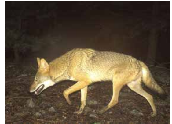
A coyote roams the woods at night.