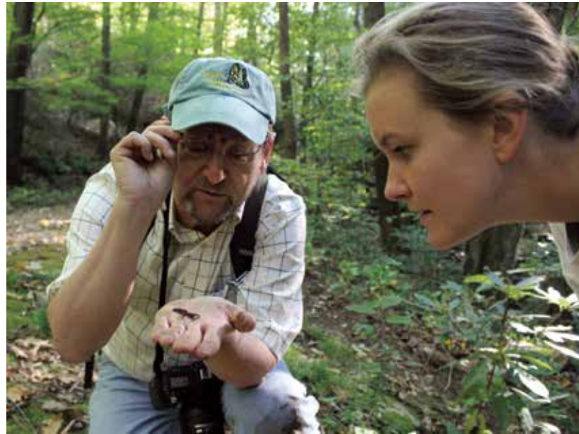
Biologists and volunteers fanned out in the woods at Rock Castle Gorge to document the plants and animals that inhabit the biodiverse area. Left, a red-spotted newt found during the bio-blitz

As the Parkway looks to restore degraded wetlands, it is important that resource managers understand the creatures that will call these areas home, including