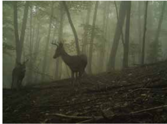
Two bucks prepare to go head to head.

Since the Foundation's initial funding of 15 remote wildlife cameras in 2009, the devices have captured more than 25,000 images of more than 35 species of wildlife, including black bears, bobcats, coyotes, red and gray foxes, elk, European wild hogs, and white-tail deer. This year, the Foundation provided 30 cameras to replace aging units and add observation locations. The photographs help resource managers understand the behavior and abundance of wildlife and will be used in interpretive programs and exhibits.