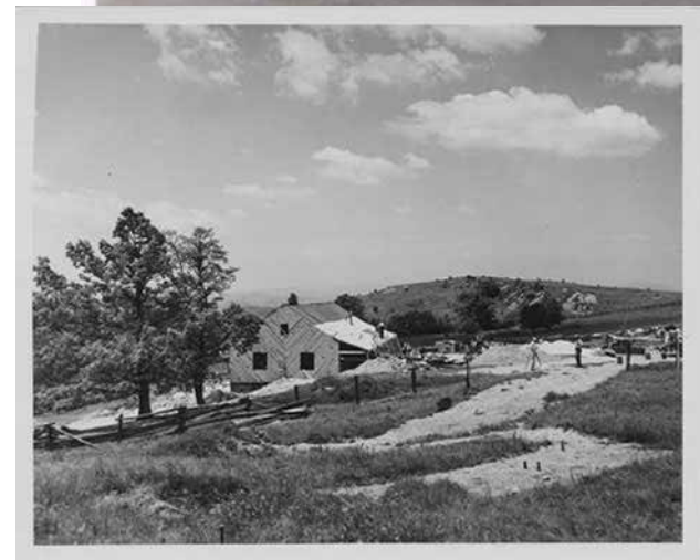
Construction of Bluffs Lodge in 1949, the year it opened.