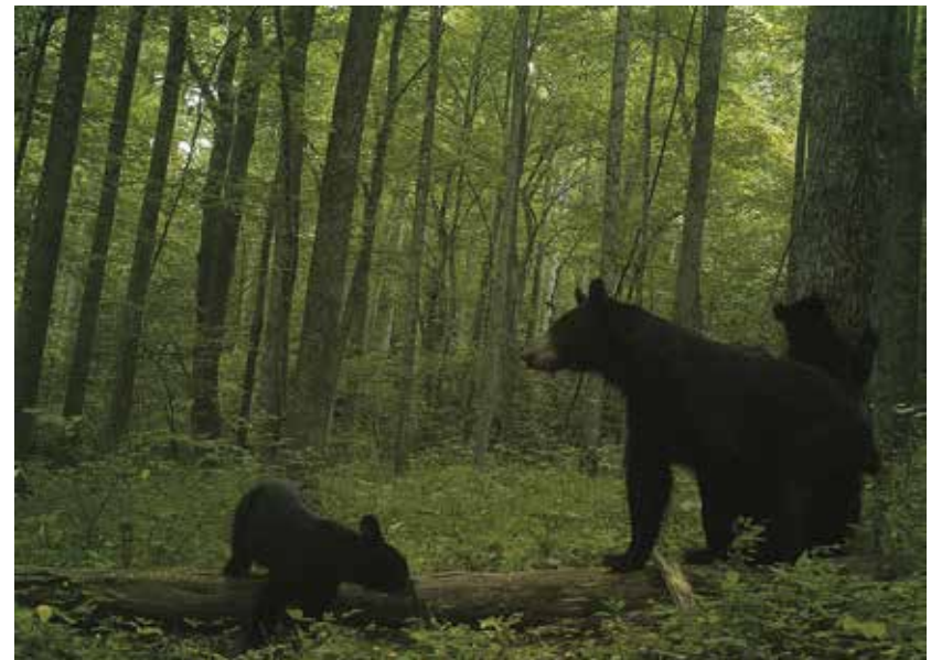
A mother bear keeps watch on her two cubs.