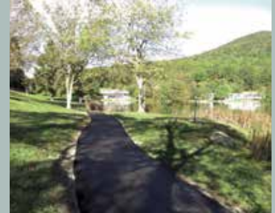
Abbott Lake Loop Trail

Milepost 86 - The repaving of the one-mile loop trail is complete! This spot, which welcomes more than 200,000 visitors each year, is the first complete ADA trail on the Parkway.