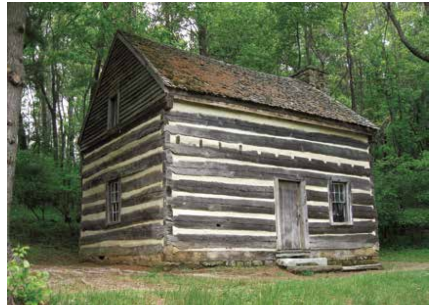
Your gift can help preserve historic structures, including Polly Woods Ordinary at milepost 86 on the Blue Ridge Parkway.