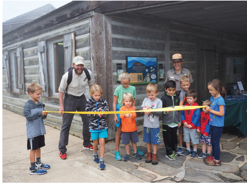
Kids in Parks celebrated the 100th anniversary of North Carolina State Parks with a ribbon cutting at the new Mount Mitchell TRACK Trail.

The Kids in Parks program is made up of 150 TRACK Trails in nine states and Washington, D.C. This year, 16 trails were added to the network in national parks, national forests, state parks, and a