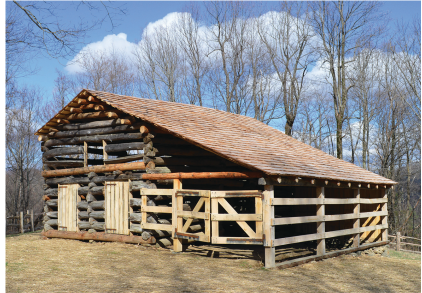
Completed barn with a new roof, replacement logs, doors, and fencing