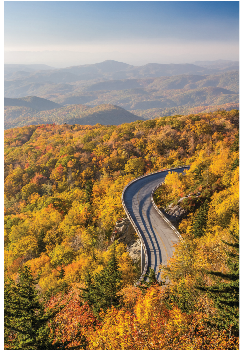
Linn Cove Viaduct, milepost 304