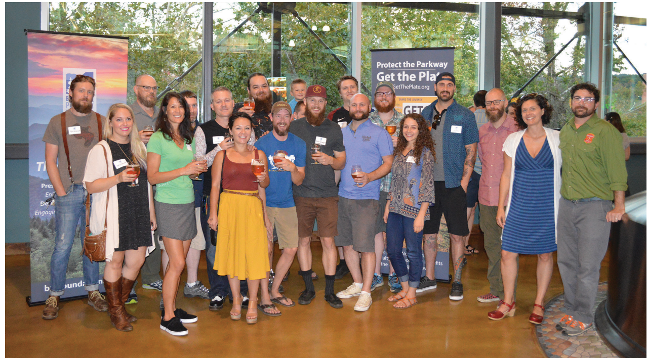
Brewery owners and employees who participated in the Find Your Pint Series gathered at New Belgium in September.

We’d like to thank the participating breweries that highlighted the community’s special bond with the Parkway: Asheville Brewing Company, Blue Ghost Brewing, Boojum