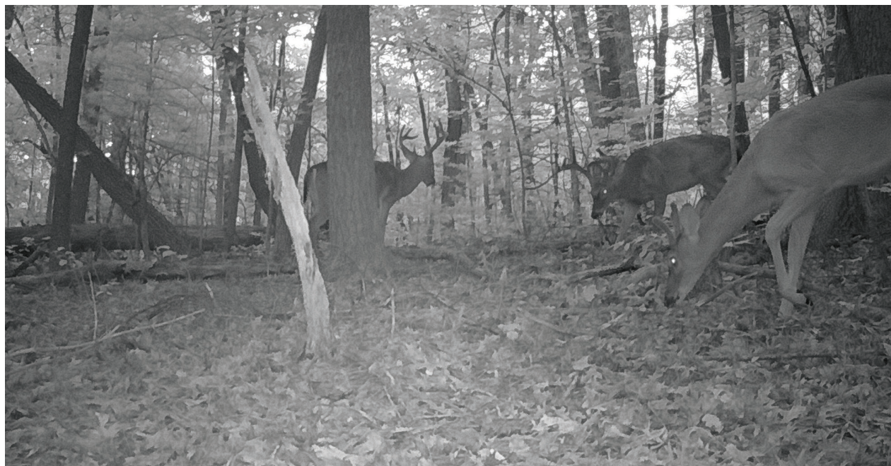
Three deer were photographed foraging in the Pisgah District of the Blue Ridge Parkway.