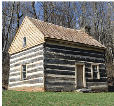
Polly Woods Ordinary complete