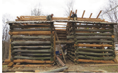
Johnson Farm Barn during rehab

This year, the completion of major initiatives at Peaks of Otter Recreation Area, milepost 87, ensured two landmarks will survive to tell the stories of the people who lived here long before the Parkway was built. Polly Woods Ordinary, a former inn and tavern for travelers in the 1800s, underwent an extensive rehab that included reinking the logs and new side gables and a roof. Before recent repairs, the barn at Johnson Farm was off limits to visitors because of concerns about its stability. Now this key asset will continue to shed light on early 20th century farm life in the mountains. Smaller outbuildings were also reroofed. Both projects were made possible thanks to funding from the 2015 Centennial Challenge, which paired funds designated by Congress with those of Foundation donors in honor of the National Park Service's 100th anniversary. The investment, including the repaving of Abbott Lake Trail, totaled $334, 598.