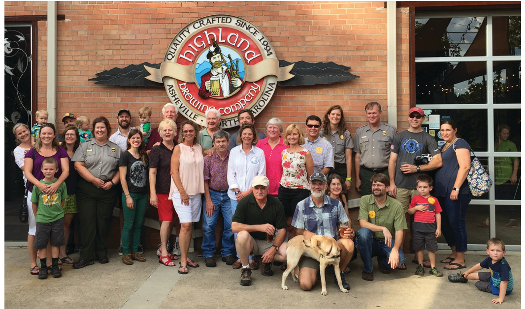
National Park Service employees and friends celebrate the 100th anniversary at Highland Brewing