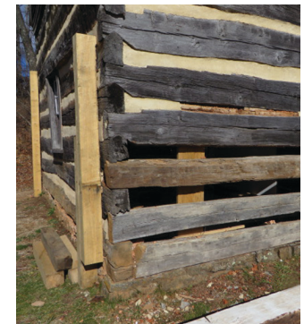
Exterior during rehab