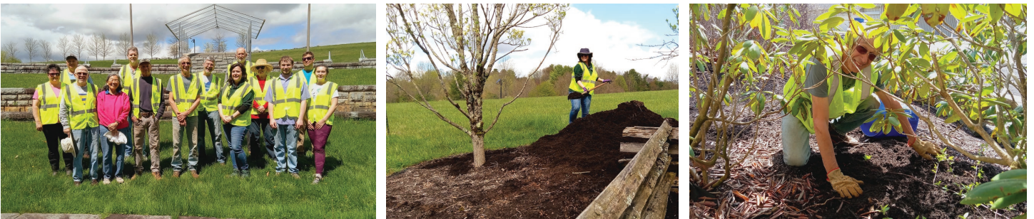
Before the Blue Ridge Music Center's opening last May, volunteers groomed the grounds in preparation for another season of mountain music experiences.