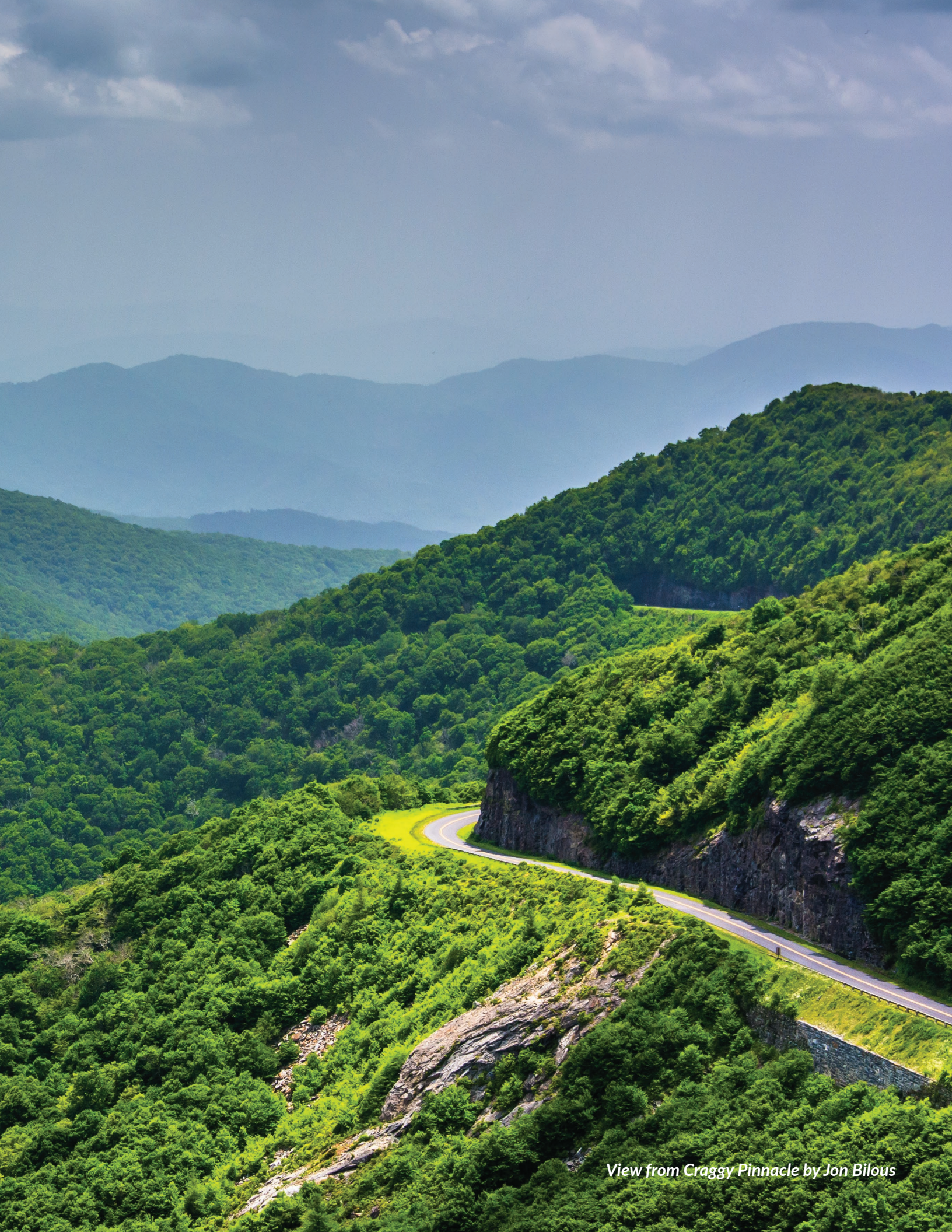
View from Craggy Pinnacle by Jon Bilous