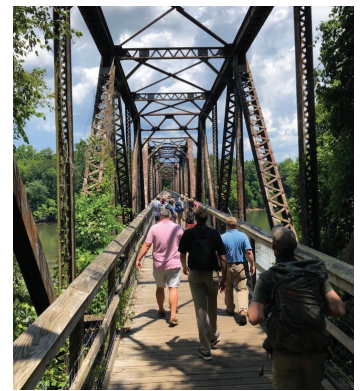
The Peak to Prosperity Palmetto trailhead and group hike in Little Mountain, S.C.