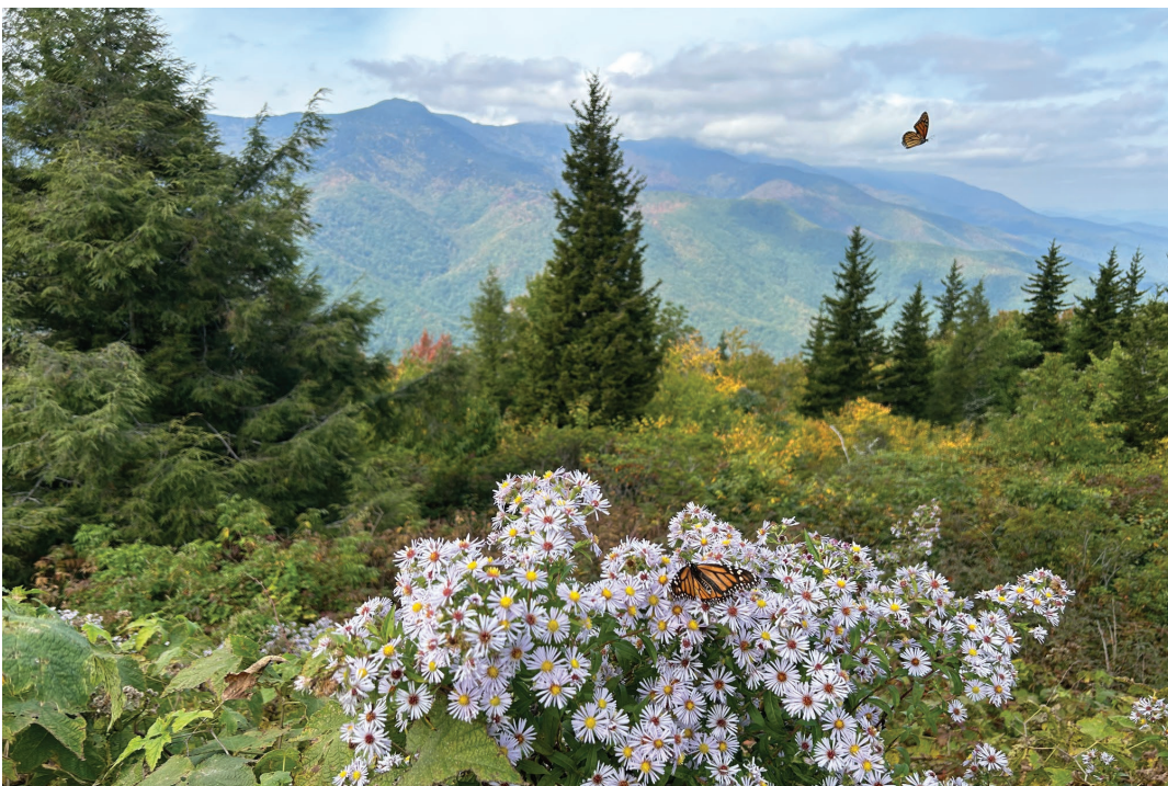
Butterflies at Mount Mitchell Overlook, milepost 350.