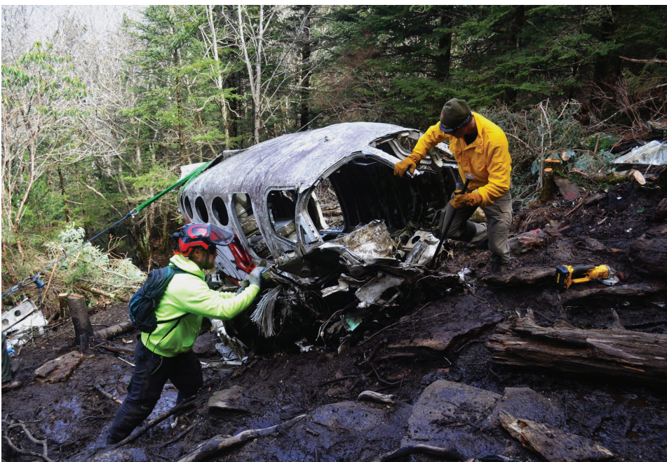
Crews worked to prepare wreckage to be lifted from the site