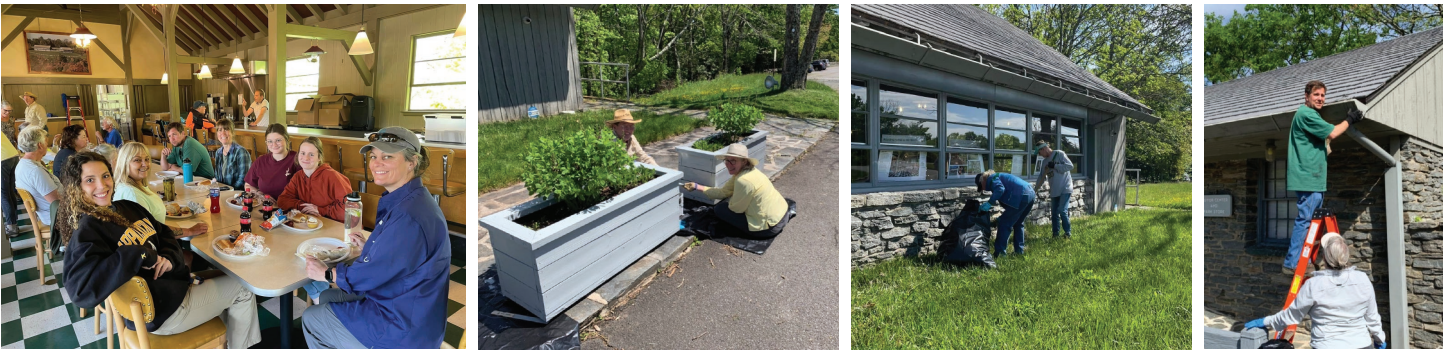
In the spring, volunteers showed their love for The Bluffs Restaurant and Doughton Park by painting flower boxes, cleaning windows, and clearing gutters before the beloved establishment welcomed diners for the season.