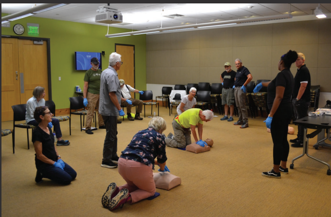
NPS volunteers train in CPR in Asheville, N.C.

Thanks to donors, Automated External Defibrillators (AEDs) were purchased and distributed to Parkway locations. National Park Service staff and more than 20 volunteers received training on the proper use of these life-saving devices and certification in first aid and CPR from the American Red Cross. Now more people are prepared to assist park visitors when emergencies arise.