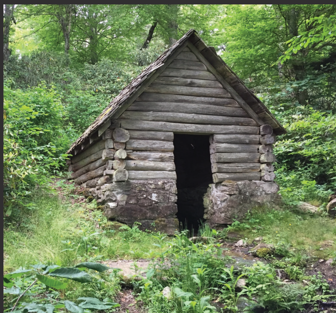
The lodge's springhouse still stands at the site

A new interpretive panel shares the story of Buck Spring Lodge, a summer hunting retreat built by George Vanderbilt in the 1890s on what was then part of his 125,000-acre estate. The sign, located in the Buck Springs Gap Overlook parking area at milepost 407.6 near Pisgah Inn, helps visitors envision the Adirondack-style structures that stood at the site until the early 1960s. Just downhill from the sign, a trail leads to the springhouse, the only remaining structure from the retreat.