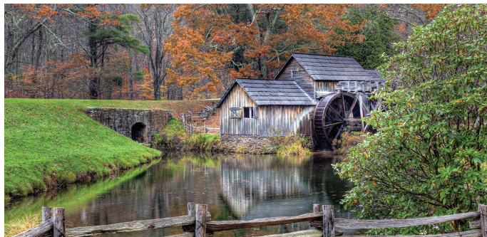
The Foundation is raising funds for repairs to Mabry Mill

Blue Ridge Parkway Foundation 717 S. Marshall St., Suite 105B Winston-Salem, NC 27101 Tax ID: 31-1512730