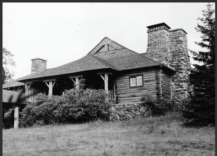
Historic photo of Buck Spring Lodge