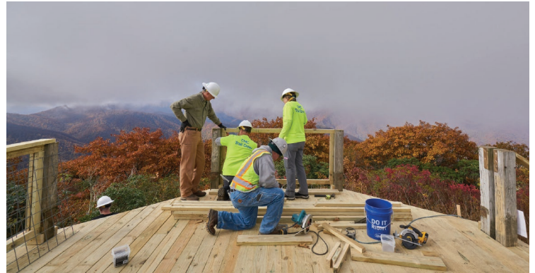
Volunteers with Carolina Mountain Club reconstruct the Mount Pisgah viewing platform.