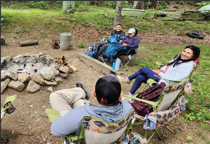
Latinos Aventureros enjoy the outdoors thanks to camping equipment and hiking poles from El Closet