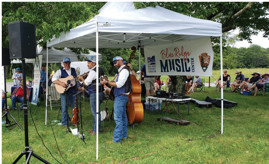
Gap Civil entertains visitors during a Milepost Music concert at Doughton Park