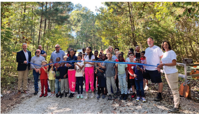
The TRACK Trail grand opening at Lynch's Woods Park in Newberry, S.C.

The Kids in Parks program began an extensive expansion of its network of family-friendly trails in South Carolina in 2023, while also adding adventures in Florida, North Carolina, Ohio, Oregon, Pennsylvania, South Dakota, Tennessee, and Virginia. Over the next four years, three TRACK Trails will be established in each of South Carolina's 46 counties for a total of 138 new locations. This expansion, made possible through a grant from the BlueCross BlueShield of South Carolina Foundation to support the goals of Diabetes Free SC, will ensure that more kids and families can engage in outdoor recreation to foster lifelong wellness and meaningful connections to public lands.