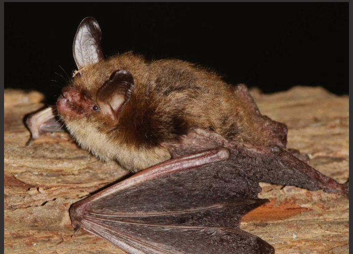
Endangered northern long-eared bat