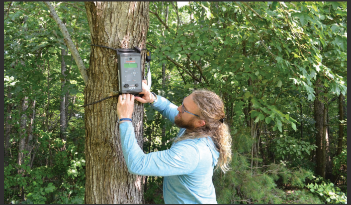
A Virginia Tech researcher attaches an acoustic detector to a tree outside the Blue Ridge Parkway headquarters in Asheville, N.C.

Students and volunteers from Appalachian State University spent two summers surveying populations of bees in the park, and the results are in. More than 100 species of bees were identified in both Virginia and North Carolina, yielding the amazing discovery of two new species since a 2015 bumblebee inventory. The federally listed endangered species Bombus affinis , the rusty patched bumblebee, was found in Virginia, and both states yielded B. pensylvanicus , the American bumblebee, a vulnerable and threatened species. The National Park Service is working to create additional pollinator sites throughout the park to help foster this trove of pollinator biodiversity.