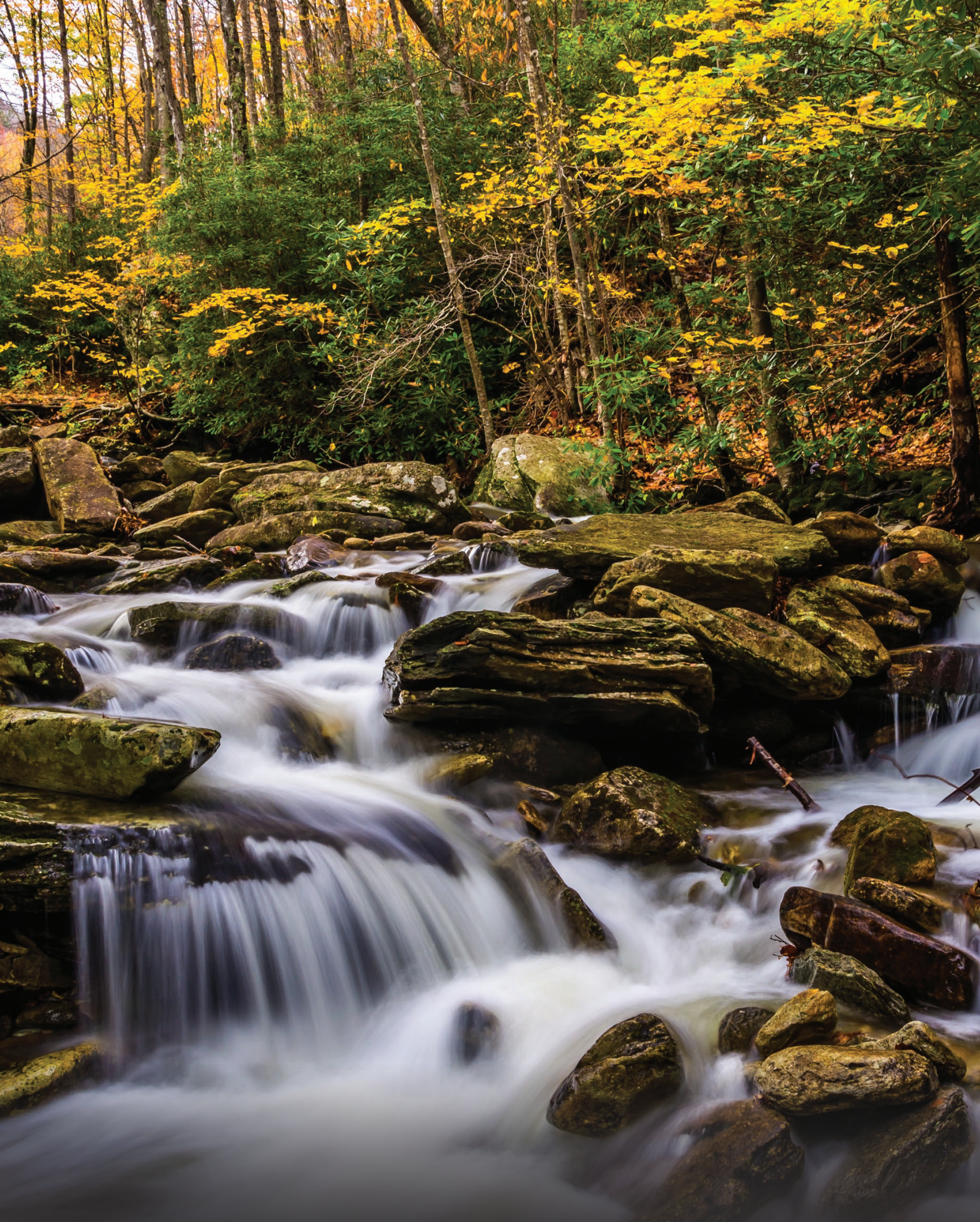
Boone Fork along the Parkway.