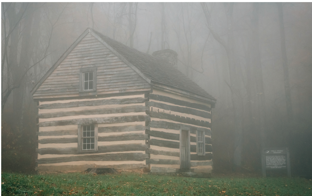
Historic Polly Woods Ordinary at Peaks of Otter, milepost 86, in Virginia