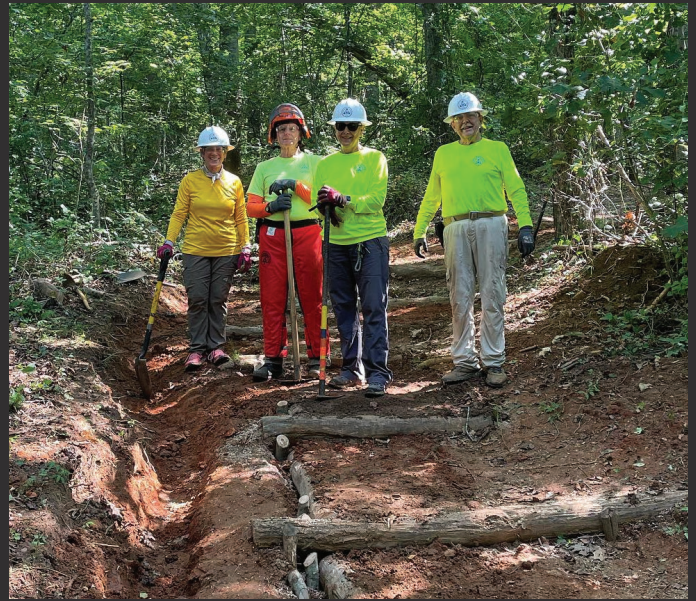
Carolina Mountain Club members repair a park trail