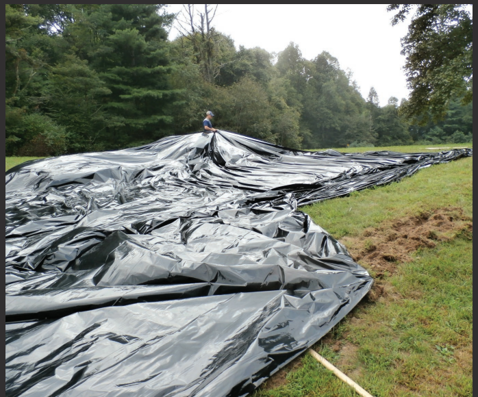
A wildflower bay is prepared through solarization