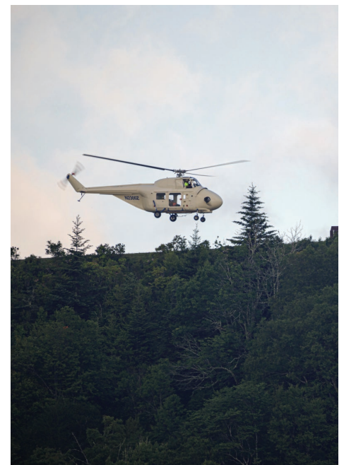
Wreckage was removed via helicopter