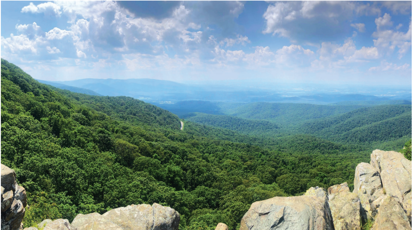
The view from Humpback Rocks at milepost 5 in Virginia.