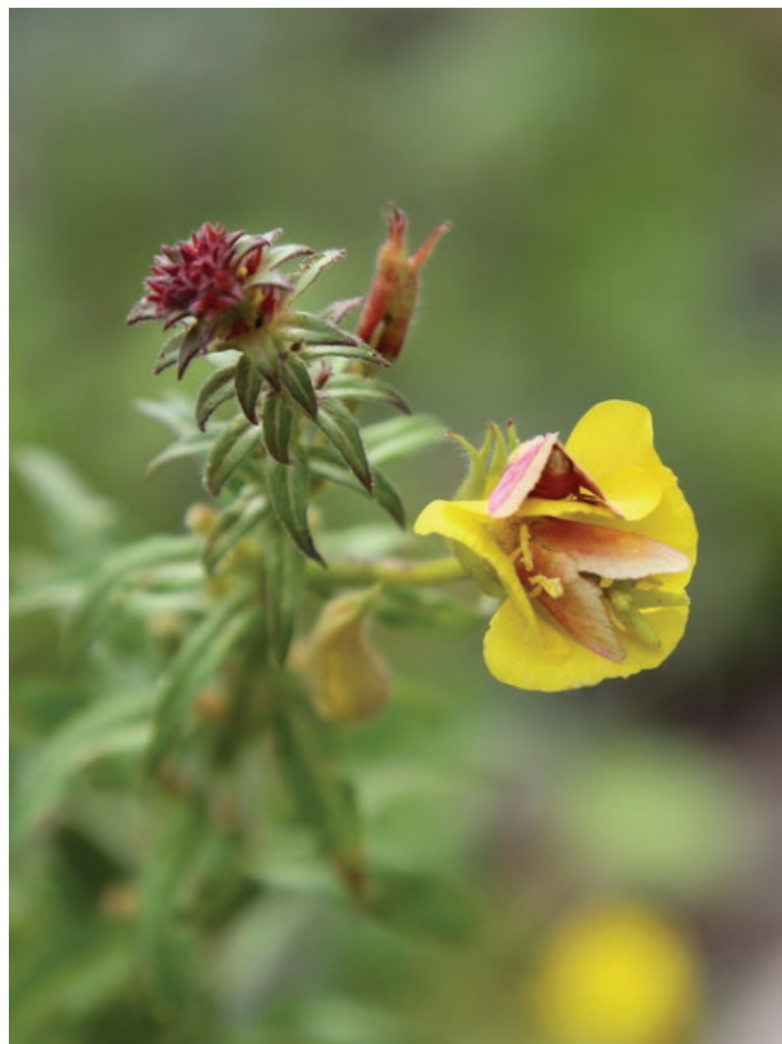
A Parkway pollinator, the Primrose moth, sleeping in an evening primrose bloom