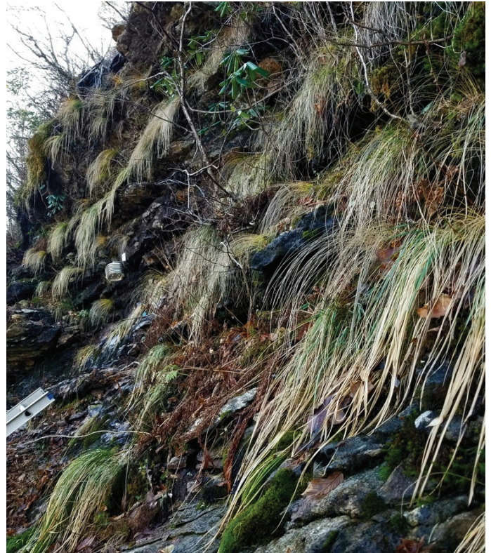
Calamagrostis cainii .

Rehabilitation of the landscape by National Park Service staff and volunteers yielded the discovery of Calamagrostis cainii , an endangered species of grass that only grows at rocky, high elevations along the North Carolina and Tennessee border. Waterrock Knob is home to a concentration of rare and sensitive species, as it is one of only four high-elevation sites in the park. The discovery of another endangered plant emphasizes the need to preserve the Blue Ridge Parkway's biodiverse landscape.