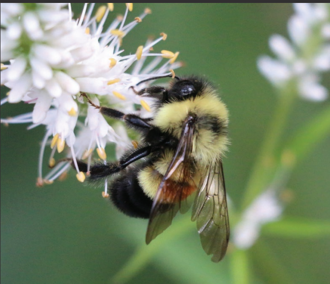
The endangered rusty patched bumblebee