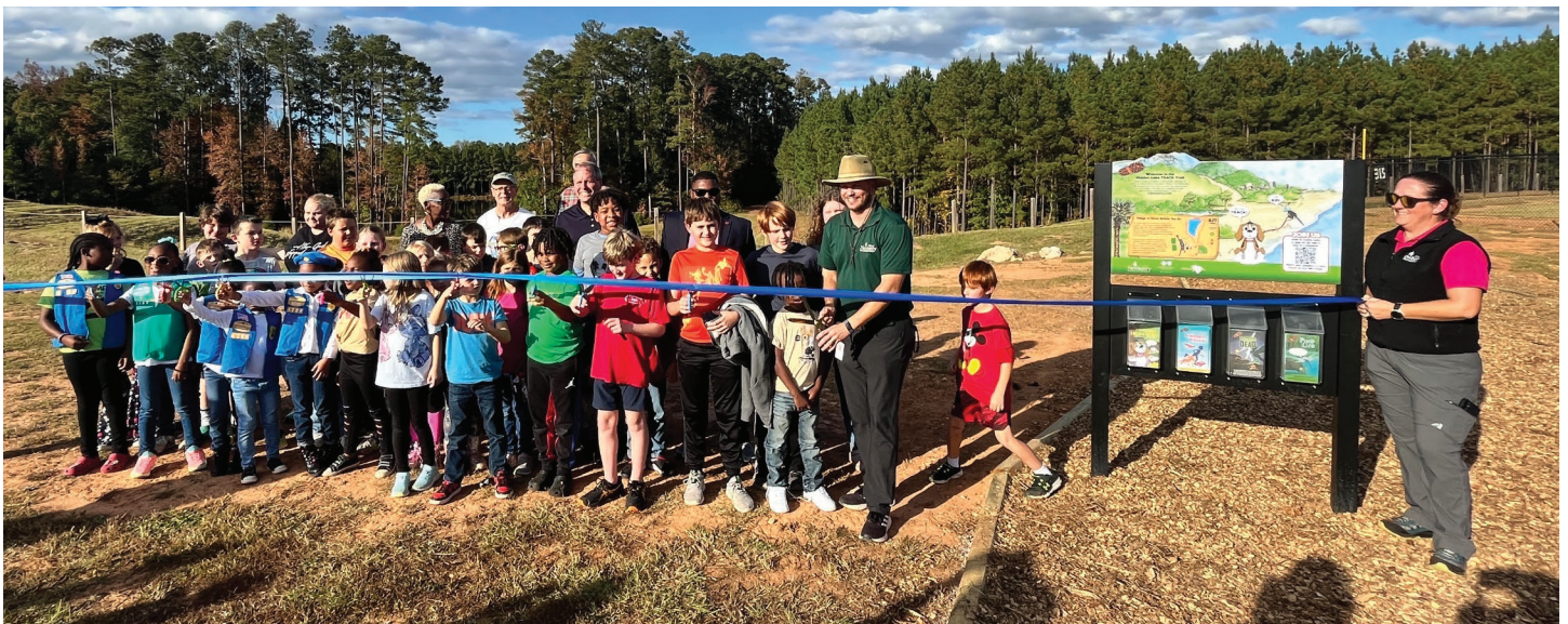
The TRACK Trail ribbon cutting ceremony at Hidden Lake at the Newberry Recreation Complex in Newberry, S.C.