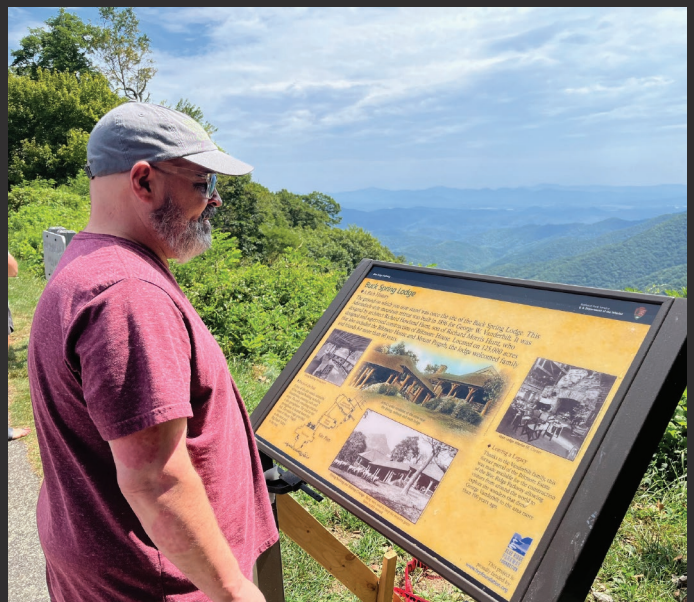
A Parkway visitor reads the new interpretive panel