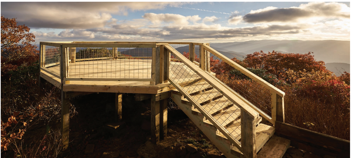
The observation deck atop Mount Pisgah replaces the original built by the U.S. Youth Conservation Corps in 1979