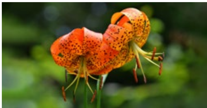
Carolina Lily.

Blue Ridge Parkway Foundation 717 S. Marshall St., Suite 105B Winston-Salem, NC 27101 Tax ID: 31-1512730