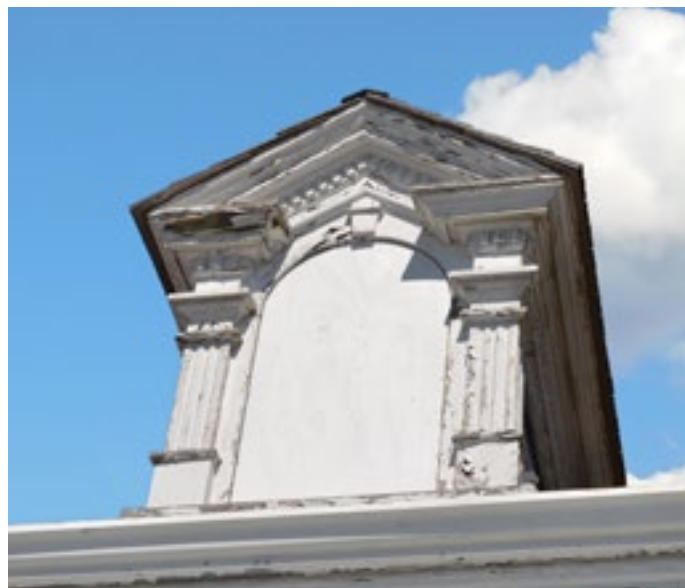
A boarded-up dormer window is one of many features that will soon be repaired at Flat Top Manor.

Soon you will be able to see that impact as the manor receives the care and attention it deserves. Thank you for your tremendous commitment, determination, and patience on this path to return Flat Top Manor to its former grandeur and honor all the history it holds.