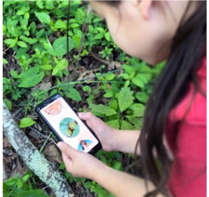
A Trail TRACKer identifies lichens as part of the Hide and Seek e-Adventure.

"People are beginning to realize, or at least